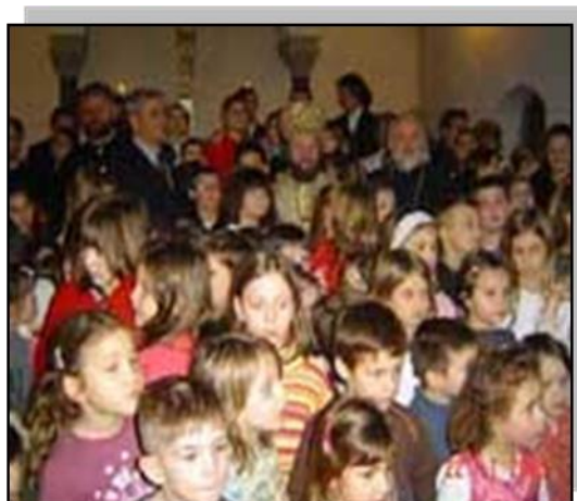
Figure 5: The opening ceremony for work of the school "Sveti Sava" 2005 in Copenhagen