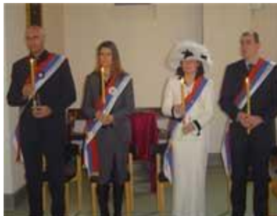
Figure 4: With modest jubilee - five years existence of the Church St George in Copenhagen, 2004