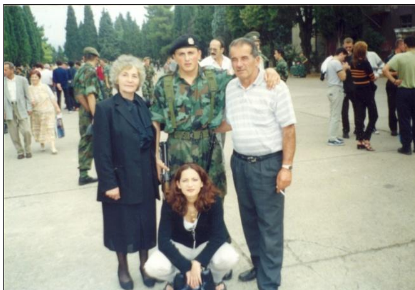
Figure 2: From Denmark to Serbia and Montenegro doing military service - a family visit to Copenhagen soldier in Podgorica (se- gen.-m.1977)

Friends of respondents are mostly migrants from the former Yugoslav republics, although none of respondents did rule, nor in any other, a negative way distanced him from socializing with strangers: