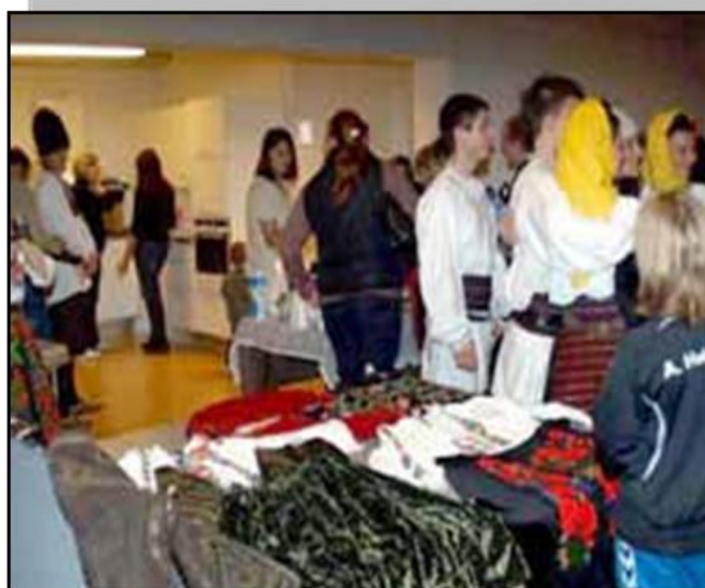
Figure 6: Serbian and Montenegrin migrants – in traditional manifestation "Night of Culture"