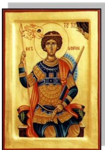
Figure 3: The icon of St. George

In Denmark, did not exist until 1998, no Serbian church, and therefore immigrants went to the Russian church of Saint Alexander Nevsky in Copenhagen. The establishment of the parish of Saint George is certainly the most important event in the history of the existence of the Serbian – Montenegrin community in Denmark. Parish belongs to the Diocese of British - Scandinavian Serbian Orthodox Church and parish activities in addition to Copenhagen are performed and in the cities and Odense and Silkeborg. Officially recognized by the Danish government in August 1998, in 1999 parish has begun a spiritual work on location Blagards Plads 6A in Copenhagen.